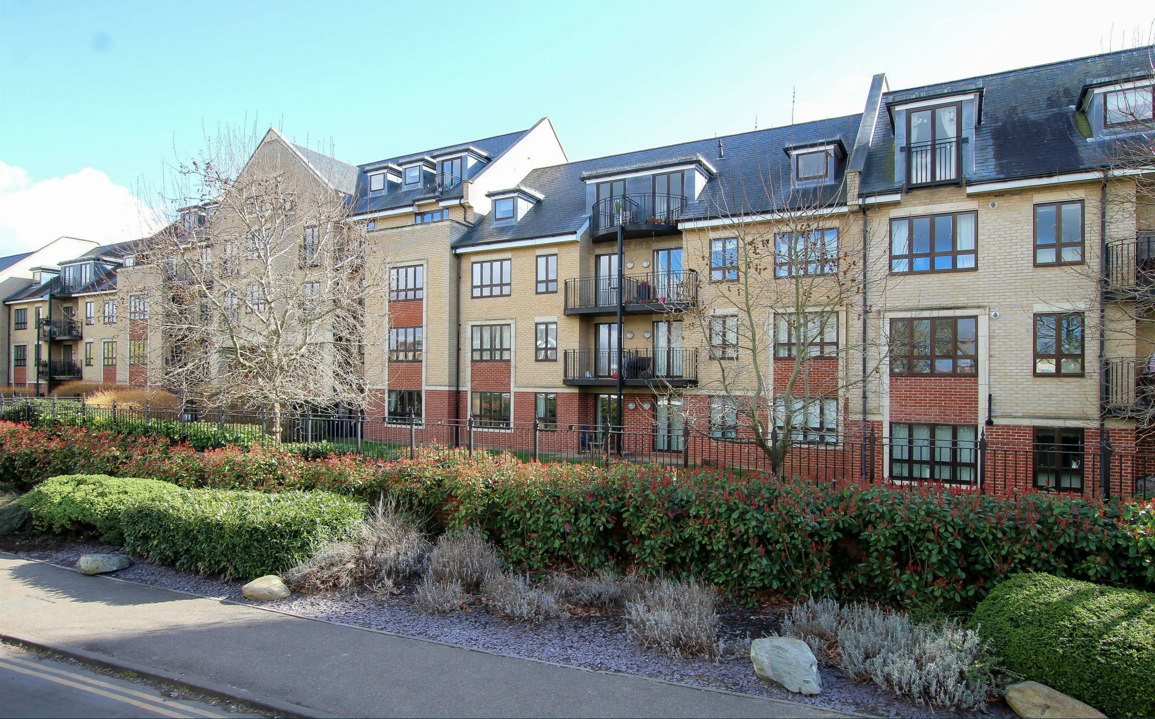
St Bartholomews Court, Riverside, Cambridge, CB5 8JD